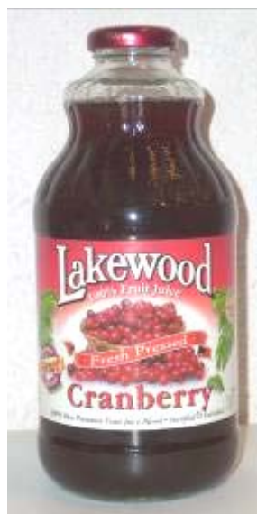
LAKWOOD CRANBERRY 100% FRUIT JUICE