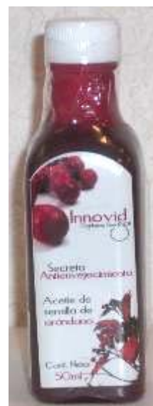
INNOVID CRANBERRY SEEDS OIL (50 ml)