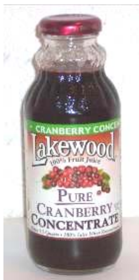
LAKWOOD PURE CRANBERRY CONCENTRATE

The following new cranberry products have appeared on store shelves this month: