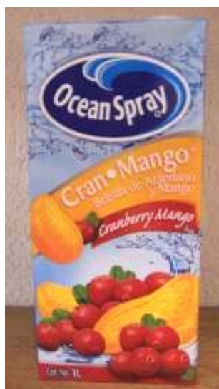
OCEAN SPRAY CRANBERRY & MANGO JUICE COCKTAIL