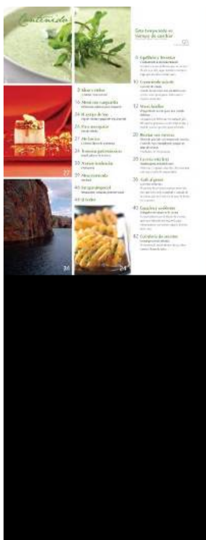
COCINA ESPECIAL MAGAZINE SEPTEMBER 2009 FRONT COVER