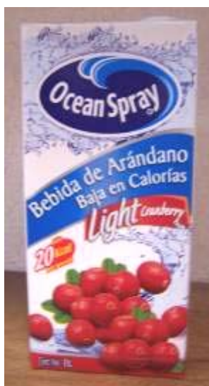
OCEAN SPRAY "LIGHT" CRANBERRY JUICE COCKTAIL