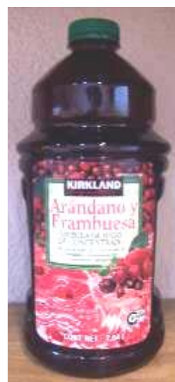
KIRKLAND CRANBERRY & RASPBERRY JUICE COCKTAIL