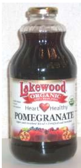
LAKWOOD ORGANIC POMEGRANATE & CRANBERRY 100% FRUIT JUICE