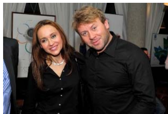
Celebrities. Michał Milowicz – actor and singer