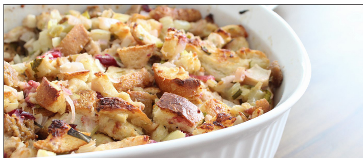
Healthy Family Project created two new cranberry recipes and videos for CMC: Cranberry Stuffing With Vegan Sausage (pictured above) and Slow Cooker Cranberry Meatballs (page 2).